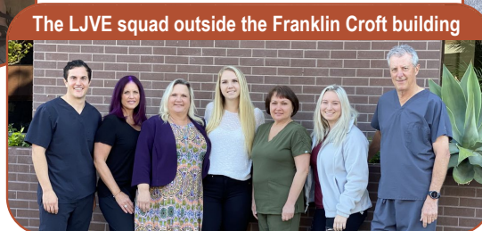
The LJVE squad outside the Franklin Croft building